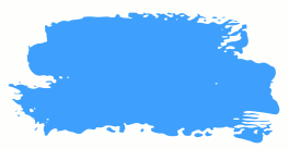
Blue KBL (Turquoise)