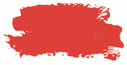
Red KGC New